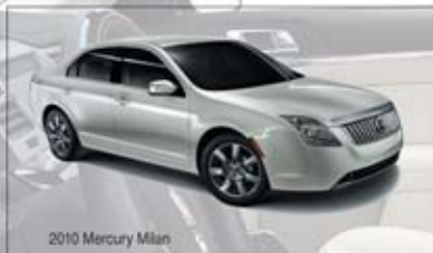
2010 Mercury Milan

Delray Lincoln Mercury | delraymotors.com