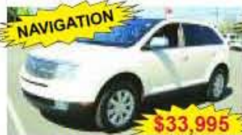
NAVIGATION 2007 LINCOLN MKX AWD 8-cyl, auto, ps, pb, air, p-seat, p-lcks, p-win, cruise, tilt, leather int., CD player, Alloy whls., 19,296 miles, Stk. No. 23687R