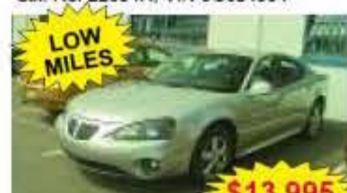
LOW MILES 2007 PONTIAC GRAND PRIX 8-cyl, auto, ps, pb, air, p-lcks, p-win, cruise, tilt, CD, 29,855 miles, Stk. No. 23668R, VIN 71189954