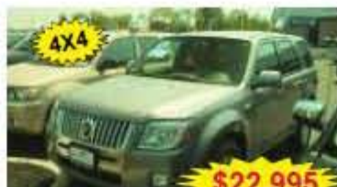
4X4 2008 MERCURY MARINER PREMIER 8-cyl, auto, ps, pb, air, 32,483 miles, p-seat, p-lcks, p-win, cruise, tilt, CD, Alloy whls., Stk. No. 23442R, VIN 8KJ36892