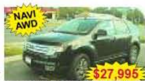
NAVI AWD 2007 FORD EDGE SEL PLUS 8-cyl, auto, ps, pb, air, p-seat, p-lcks, p-win, cruise, tilt, leather int., CD, vista roof, 23,091 miles, Stk. No. 23478RVIN 7BA94447