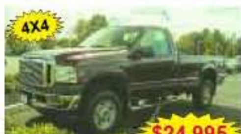
4X4 2007 FORD F-250 SD XL 4X4 8-cyl, auto, ps, pb, air, am/fm, bedliner, 33,420 miles, Stk. No. 23533R, VIN 7EA23400