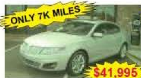
ONLY 7K MILES 2009 LINCOLN MKS AWD 8-cyl, auto, ps, pb, air, p-seat, p-lcks, p-win, cruise, tilt, leather int., CD, navigation, Alloy whls., vista roof, 7,108 miles, Stk. No. 22954R, VIN 9G604334

NO CALLS OR EMAILS PLEASE... Just Visit Freehold Ford and Drive Home in Your New Pre-Owned CAR, TRUCK, SUV or CROSSOVER with Rebates up to $4500!