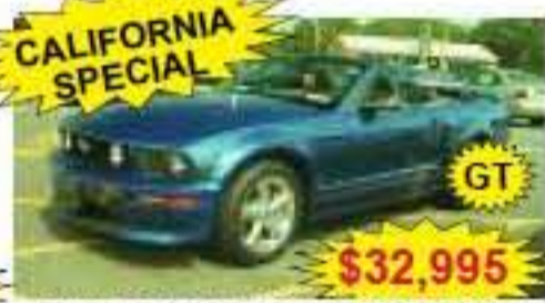
CALIFORNIA SPECIAL 2009 FORD MUSTANG GT CONV. CALIFORNIA SPECIAL 8-cyl, auto, ps, pb, air, p-seat, p-lcks, p-win, cruise, tilt, leather int., CD, Alloy whls., 308 miles, Stk. No. 22373, VIN 95119417