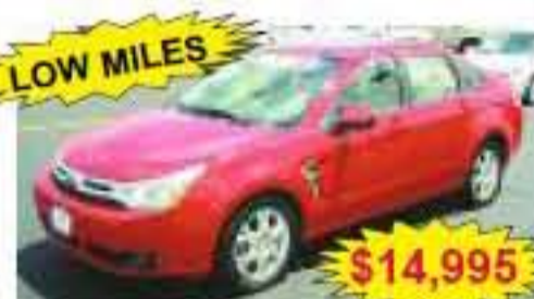
LOW MILES 2008 FORD FOCUS SE 4-cyl, auto, ps, pb, air, p-lcks, p-win, CD player, Alloy whls., 36,324 miles, Stk. No. 23684R