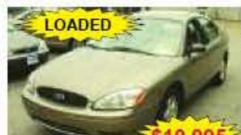
LOADED 2006 FORD TAURUS SEL 8-cyl, auto, ps, pb, air, p-seat, p-lcks, p-win, cruise, tilt, CD player, Alloy whls., 53,872 miles, Stk. No. 23691