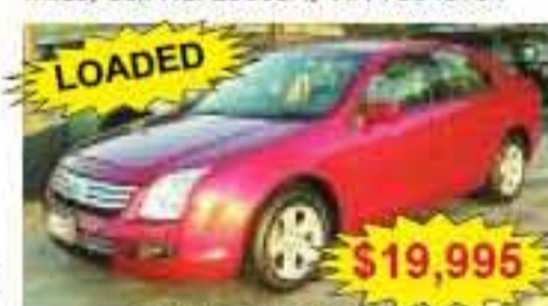
LOADED 2009 FORD FUSION SE 4-cyl, auto, ps, pb, air, p-seat, p-lcks, p-win, cruise, tilt, CD player, Alloy whls., 35,914 miles, Stk. No. 23669R