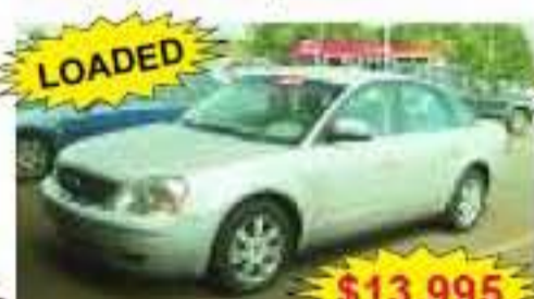
LOADED 2005 FORD 500 8-cyl, auto, ps, pb, air, p-seat, p-lcks, p-win, cruise, tilt, CD, Alloy whls., 49,745 miles, Stk. No. 23667R, VIN 5G164950