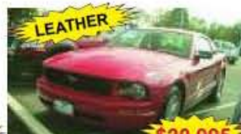
LEATHER 2007 FORD MUSTANG 6-cyl, auto, ps, pb, air, p-seat, p-lcks, p-win, cruise, tilt, CD, Alloy whls., Red, 37,999 miles, Stk. No. 23663R, VIN 75343794