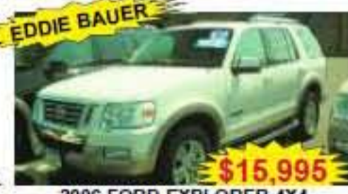
EDDIE BAUER 2006 FORD EXPLORER 4X4 8-cyl, auto, ps, pb, air, p-seat, p-lcks, p-win, cruise, tilt, leather int., CD, Alloy whls., 88,928 miles, Stk. No. 23626 VIN 6ZA28711