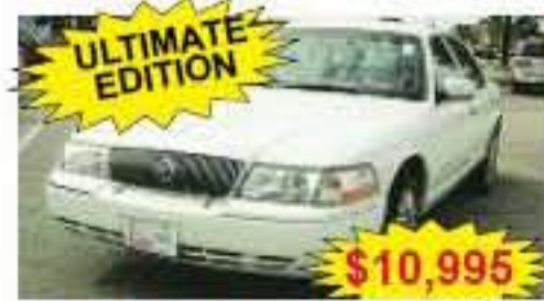
ULTIMATE EDITION 2003 MERCURY GRAND MARQUIS LS 8-cyl, auto, ps, pb, air, p-seat, p-lcks, p-win, cruise, tilt, leather int., CD player, Alloy whls., 12,851 miles, Stk. No. 23692