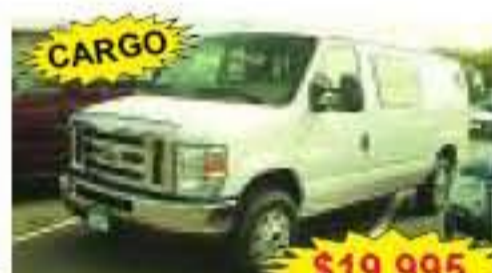
CARGO 2008 FORD E-150 CARGO VAN 8-cyl, auto, ps, pb, air, p-lcks, p-win, cruise, tilt, am/fm, bulkhead, 13,871 miles, Stk. No. 23657R, VIN 8DA34689