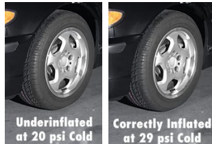
Underinflated at 20 psi Cold